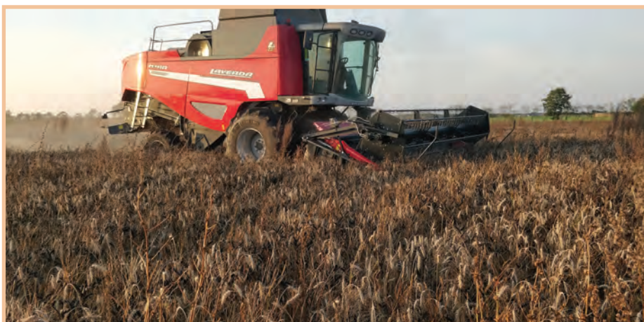
Figure 1 Harvest of a wheat–lupin mixture in Denmark with a Laverda M410 combine harvester from AGCO Group (14/08/2020).

Separating grains after harvesting remains a major obstacle to the development of associated crops. Opinions differ on the feasibility of sorting because the constraints are different between the farmer sorting on the farm, the manufacturer of sorting equipment and the collection managers of a cooperative. The expected results also