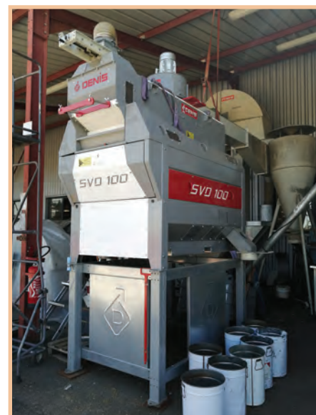
Figure 2 SVD100 vibrating cleaner from Etablissements Denis used to demonstrate the feasibility of the separation of species mixture and the resulting economic benefit