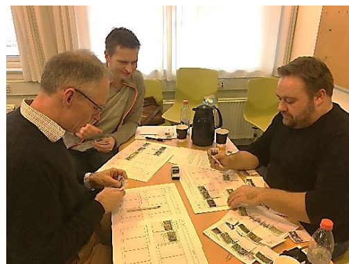
Photo 3 and 4: A board game for farmers designed to create species mixtures in a rotational perspective – stimulating on farm species mixture testing the following season.