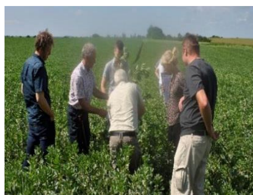
Photo 5 and 6: Peer-to-peer farmer interactions visiting single fields to observe and discuss species mixtures established according to expectations of the host farmer.