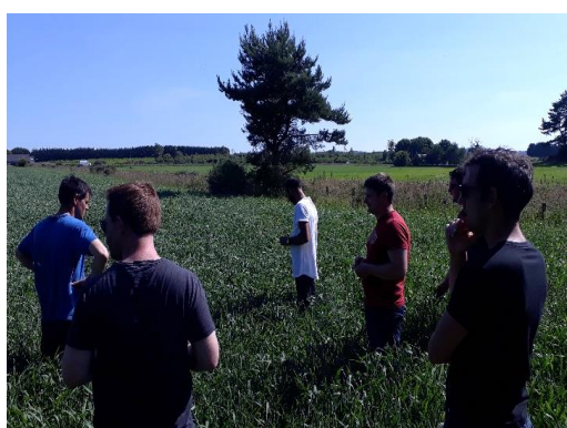
Photo 1: Field of pea and wheat destined for chicken feed.