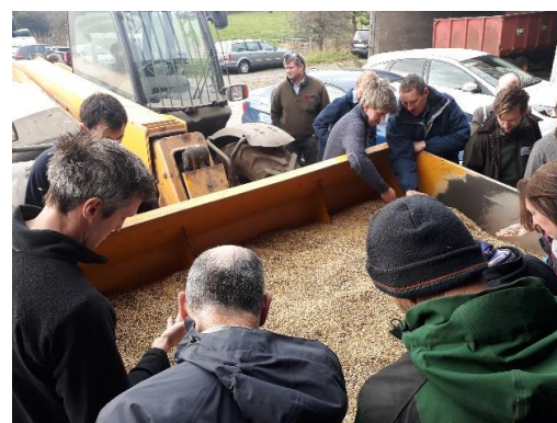
Photo 2: combined grain from a barley, pea and oilseed rape intercrop for a separator prior to sale.