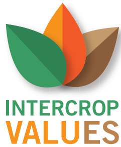
Color version of the original logo (3 ink)