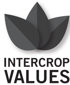
Grayscale version of the logo