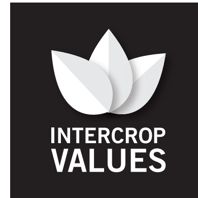
White version of the logo